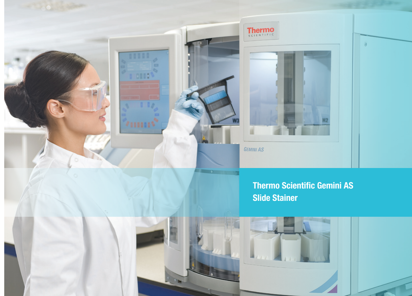
Thermo Scientific Gemini AS Slide Stainer